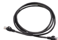
1 x 1.5m black Ethernet cable