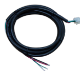
1 x Power supply cable with fitted Molex connector