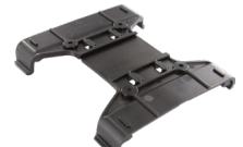
1 x DIN rail mounting bracket