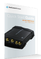
1 x Quick start guide