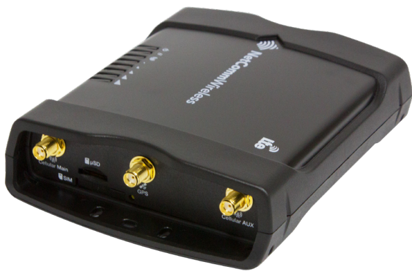
1 x NetComm 4G WiFi M2M Router (NTC-140)