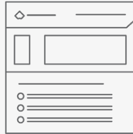
1 x Welcome Card