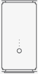
1 x 5G / LTE WiFi 6 Indoor Residential Gateway