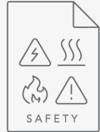
1 x Safety Card