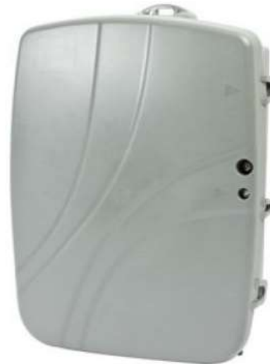
42xx Fiber Termination Enclosure

DZS Headquarters Plano, TX USA info@DZSi.com www.DZSi.com/contact-us